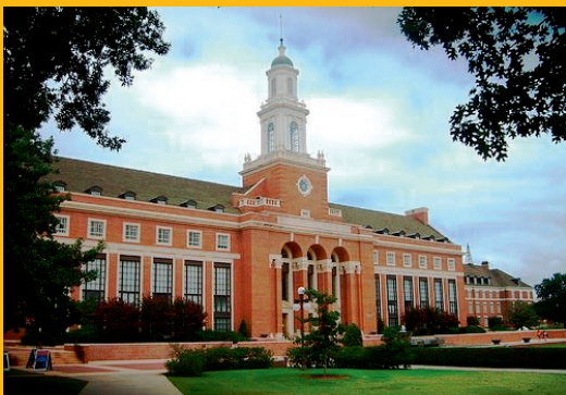
Oklahoma State University

“Hagan Scholar Testimonials” can be found on the HSF website, under the Scholarship Information Link.