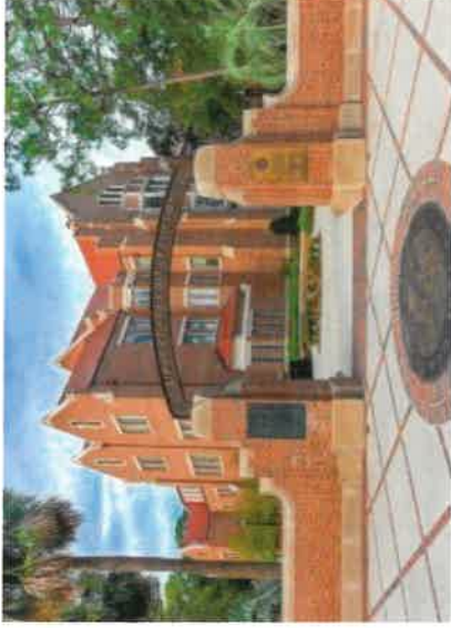
University of Florida