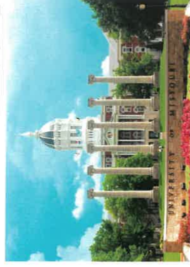
University of Missouri-Columbia

Free Workshops, Free Brokerage Accounts, and Free Study Abroad provide recipients with a practical understanding of important life skills not typically covered in the school curriculum.