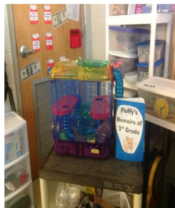
Our new class pet Fluffy.