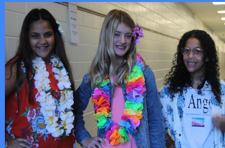
DRESS UP DAYS