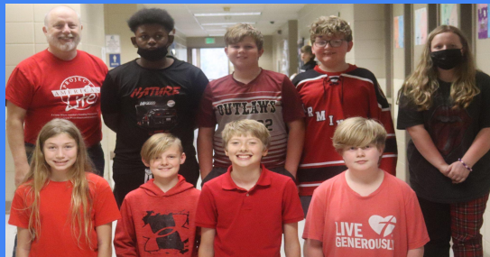
RED RIBBON WEEK