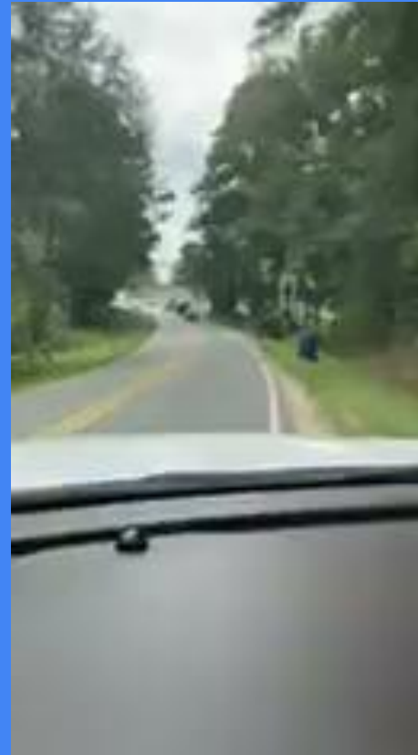
Car line from 39