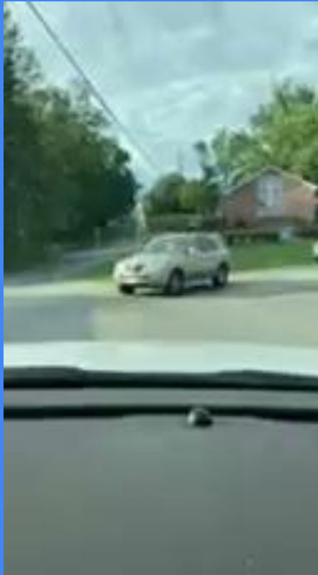
Car line from 337