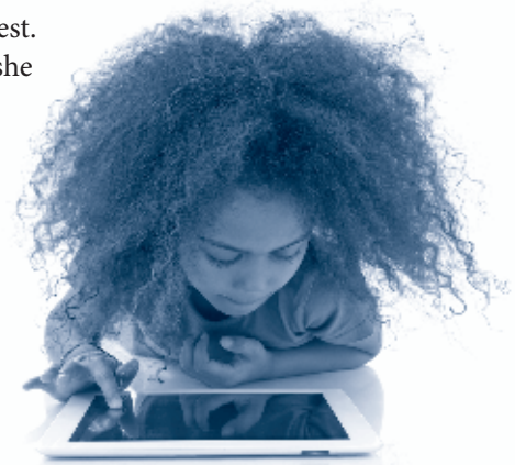
© 2014 College Board. All rights reserved.

At issue: With the use of new, kid-enchancing technologies, are savvy marketers gaining the upper hand on parents? Are toy marketers such as Ganz, food marketers such as McDonald's and kid-coddling apparel retailers such as 77kids by American Eagle too eager to target kids?