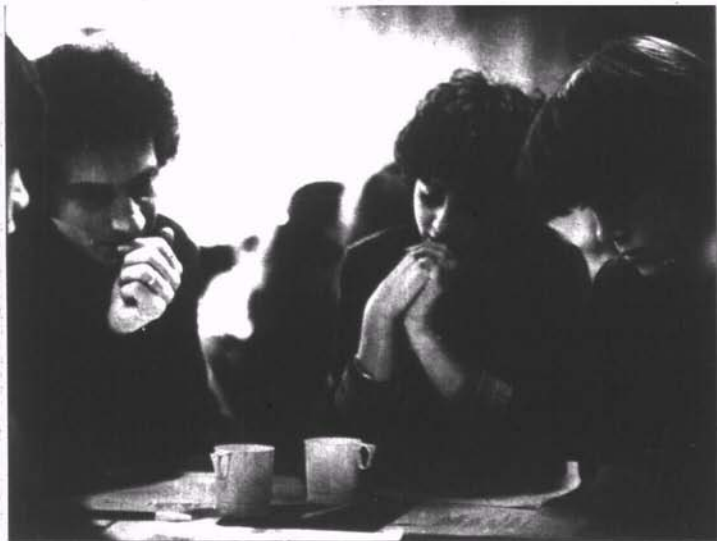
Once each team has presented its own position and argued for the opposing position as well, the group synthesizes both sides to write a report on the role of regulations in hazardous waste management.

Consider the following illustration. A teacher assigns students to groups of four composed of two-person advocacy teams and asks them to prepare a report entitled "The Role of Regula-