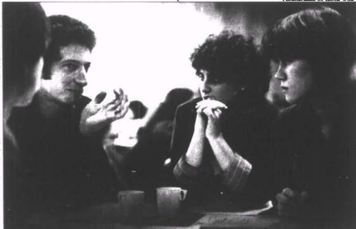
After studying factual information and planning their presentations, each advocacy team tries to convince the other of the correctness of its position regarding hazardous waste regulations.